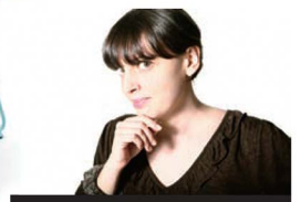
Alessandrabaldereschi Studio "FildeFer collection" "铁丝收藏品"